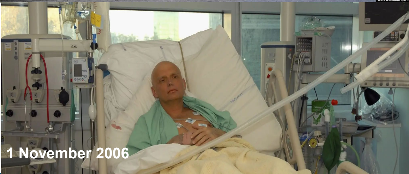
1 November 2006