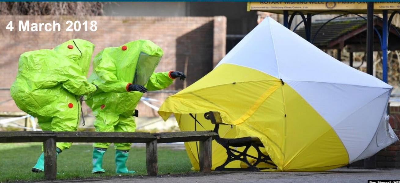
4 March 2018